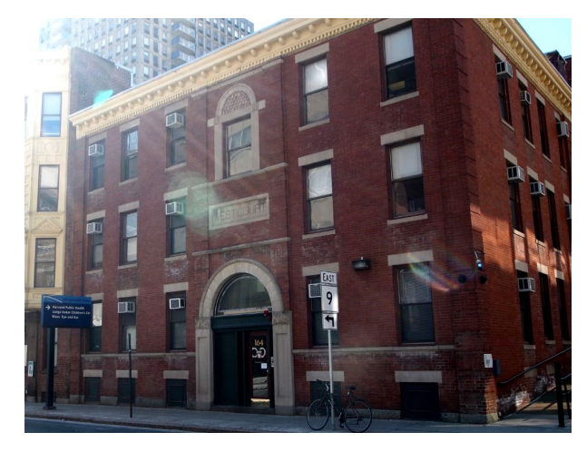
160-164 Longwood Avenue