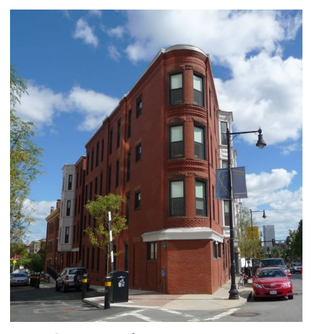
641 Huntington Avenue