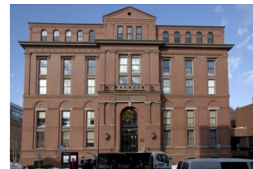
Peabody Museum of Archaeology and Ethnology at Harvard University