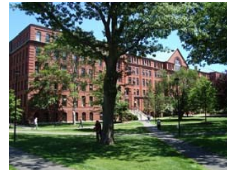
Harvard Museum of Science & Culture (HMSC)