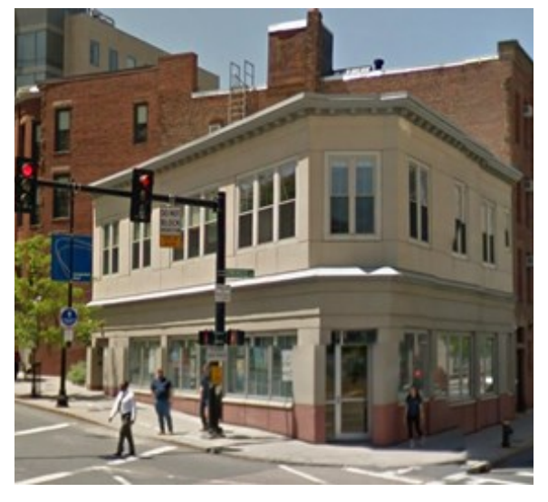
158 LONGWOOD AVENUE