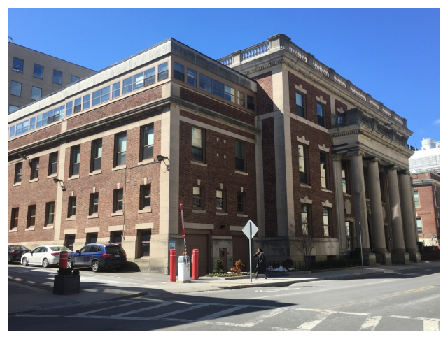
180 LONGWOOD AVENUE