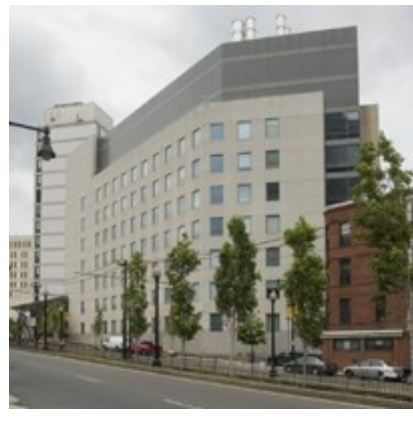
651 Huntington Avenue