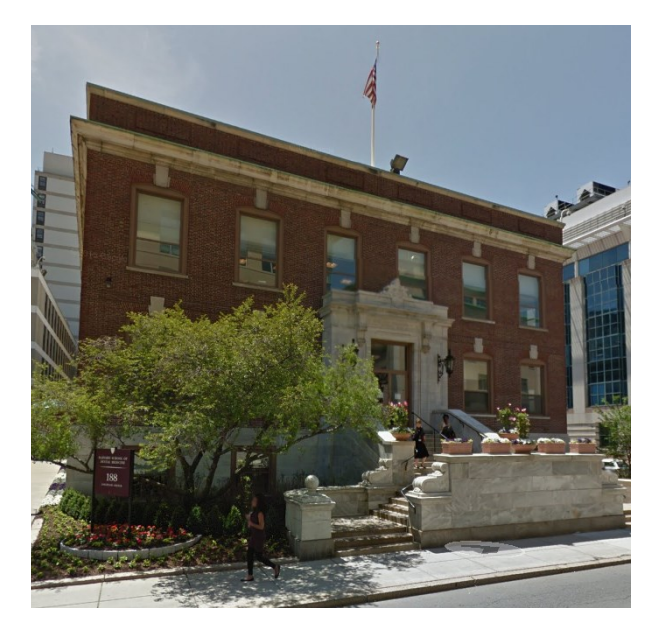
188 LONGWOOD AVE.