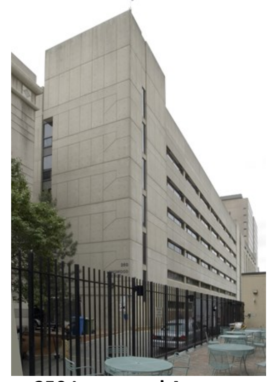
250 Longwood Avenue