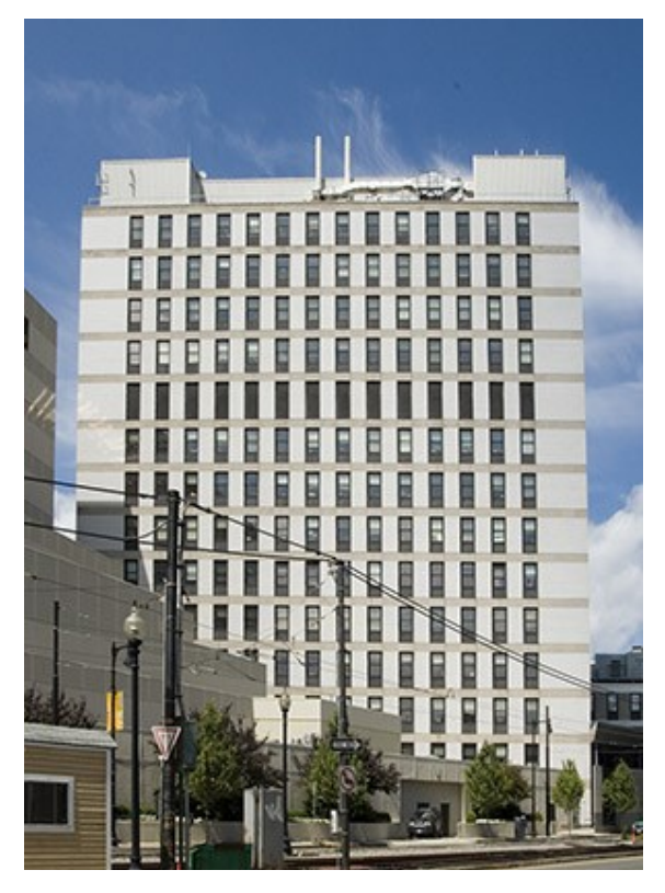
655 Huntington Avenue