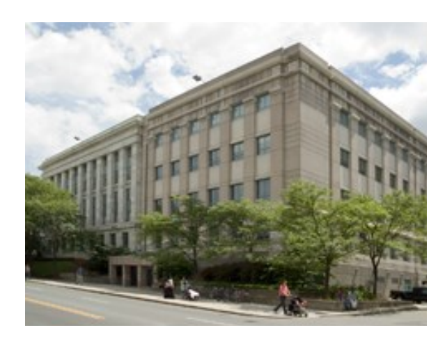
260 Longwood Avenue