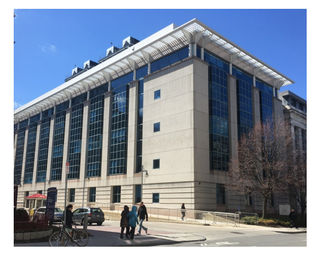
200 Longwood Avenue