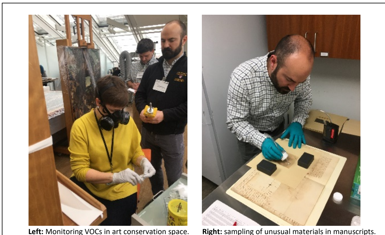
Left: Monitoring VOCs in art conservation space.