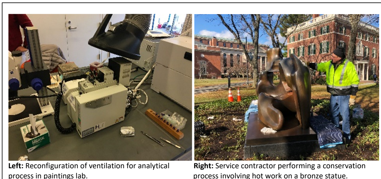
Left: Reconfiguration of ventilation for analytical process in paintings lab.