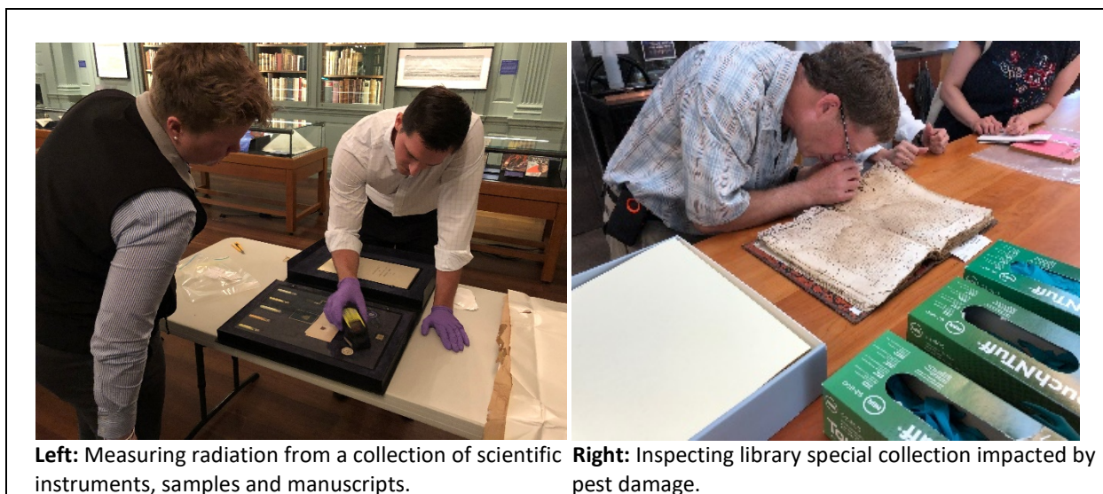
Left: Measuring radiation from a collection of scientific instruments, samples and manuscripts.