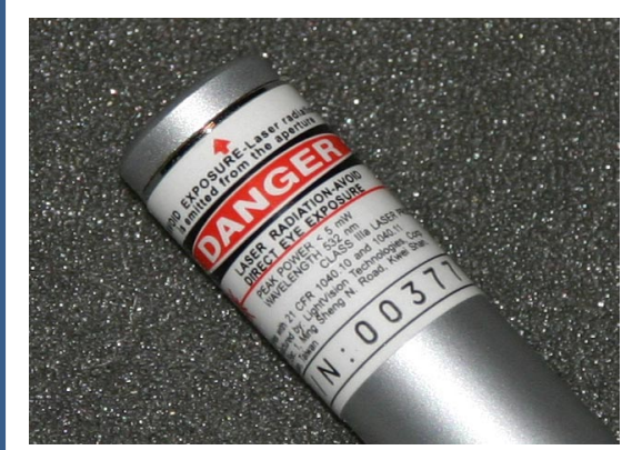
The warning label designs may not be the same. But the labels have to include: the starburst insignia, laser classification, maximum output power (in mW), and wavelength (in nm).

Only use laser pointers that have clear warning labels. Many pointers that do not have warning labels have not had a hazard analysis performed and may be more powerful than expected.