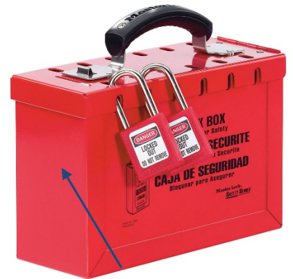
Lock 498A) with Personal Locks affixed. The key to the Group Locks is secured in the box.