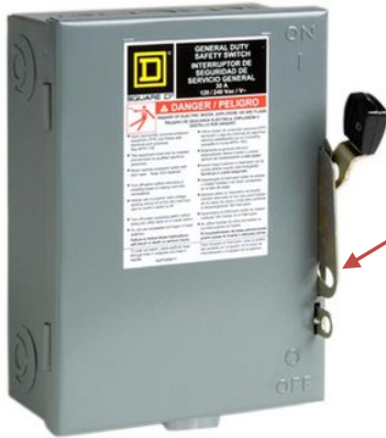
An Energy Isolating Device which is capable of being locked out