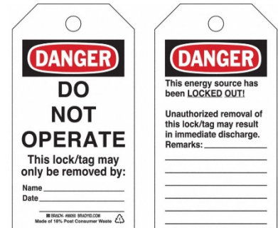
Tagout device for one Authorized Employee (Brady Tag # 66050)