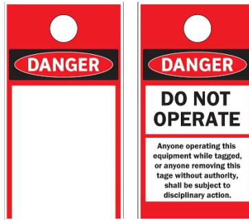
Tagout Device for Group Lockout (Electromark)