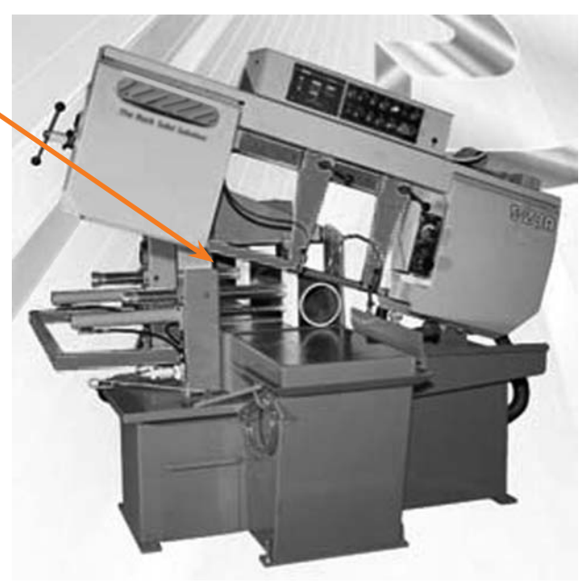
RL Johnson Co.