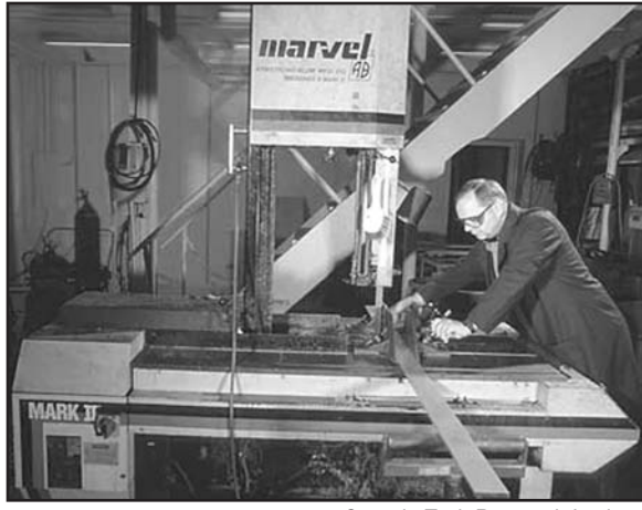
Georgia Tech Research Institute