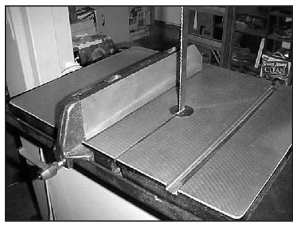
Large portion of exposed blade at point of operation.